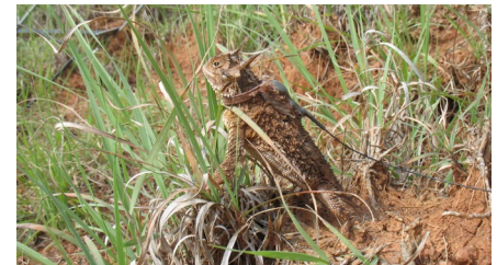
Crew members prepare a KC-135 Stratotanker for an air refueling mission exercise (top). The Texas Horned Lizard is a state sensitive species that is actively managed by the installation (bottom).